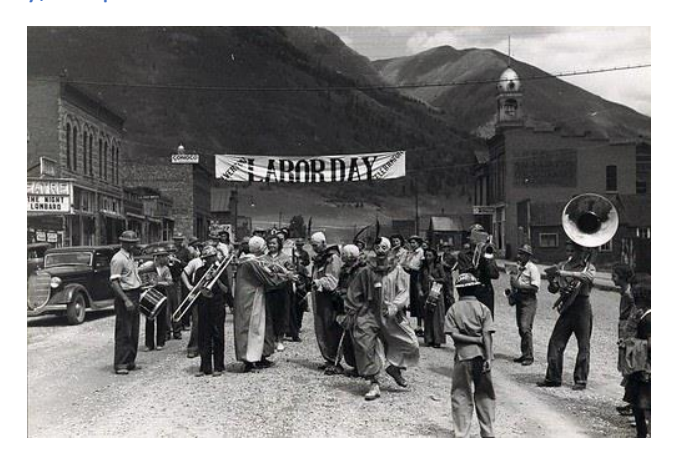
1 - The Management Office is closed Monday.