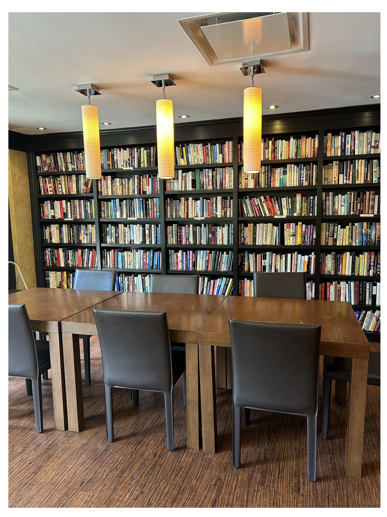
All meetings are in the library, unless otherwise stated.