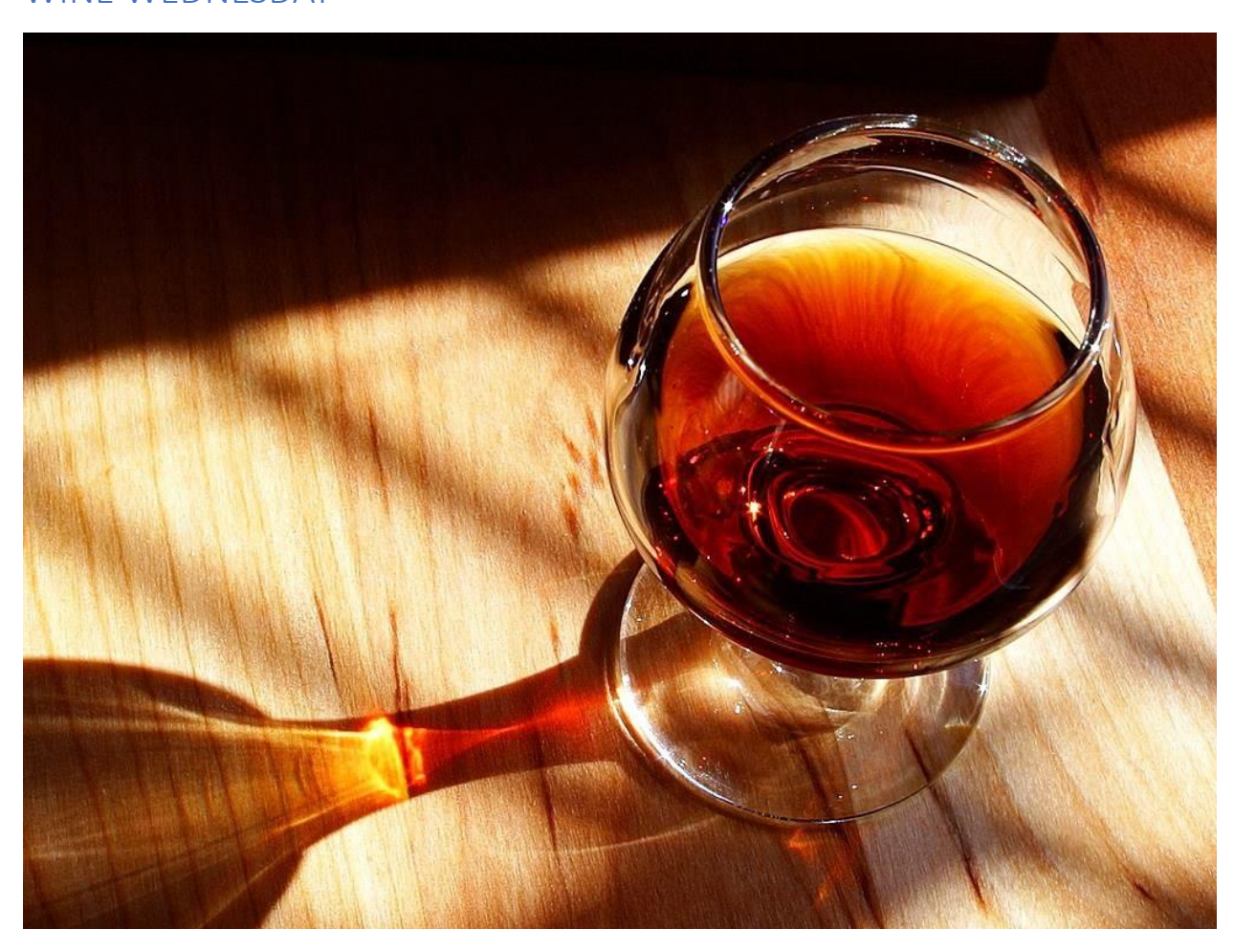
September's Wine Wednesday will be held on Wednesday, September 4th from 5:30 to 7:00 p.m. in the Party Room. No reservations required. Just bring yourself/ves and your beverage and snack(s) of choice